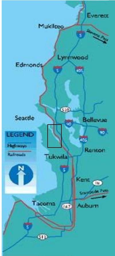
Puget Sound Region